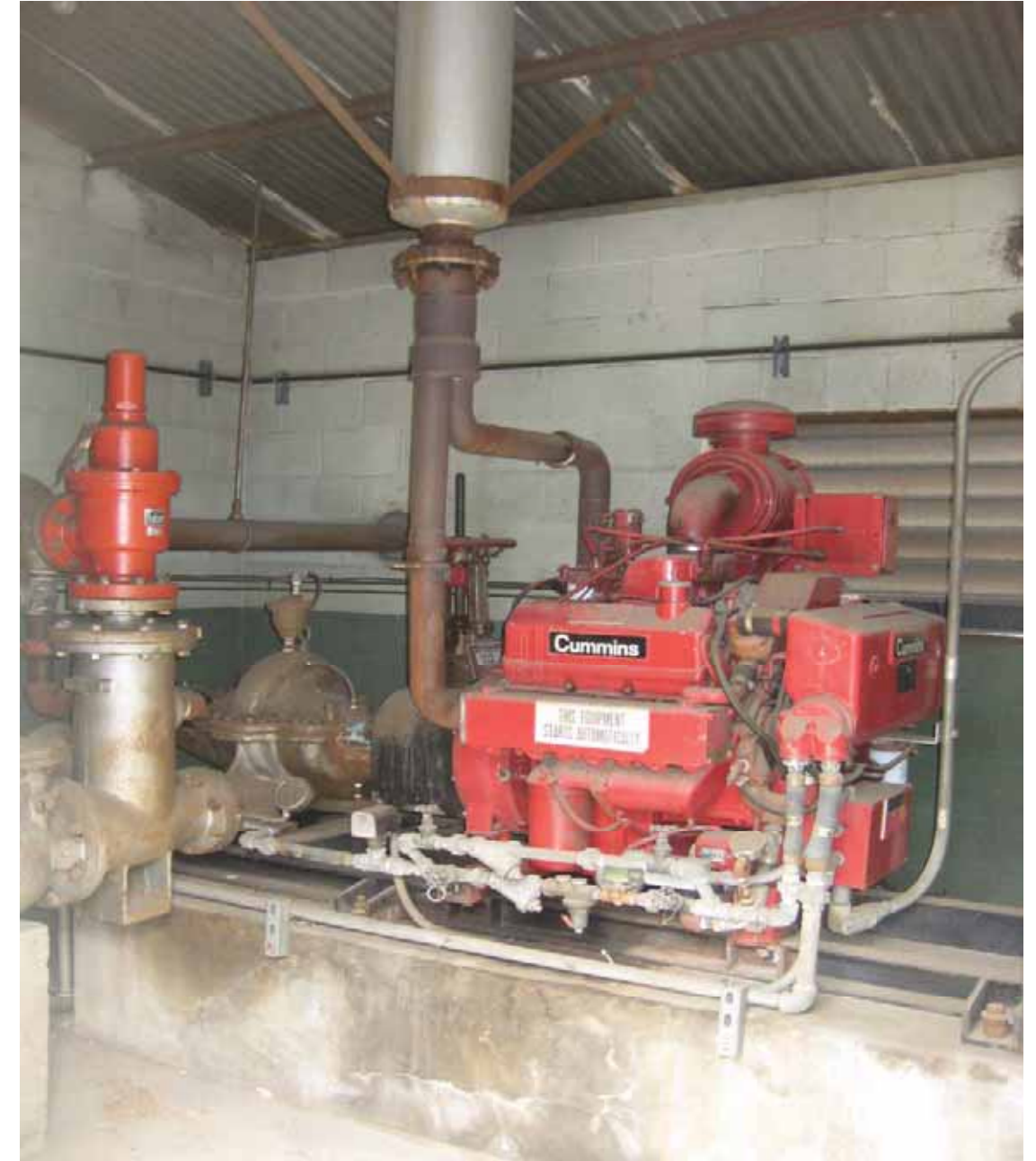
Building 123 - Pump Headquarters Associated with Standby Water Tank Interior, Northwest Elevation, detail of pump, San Diego, California, October 2009.