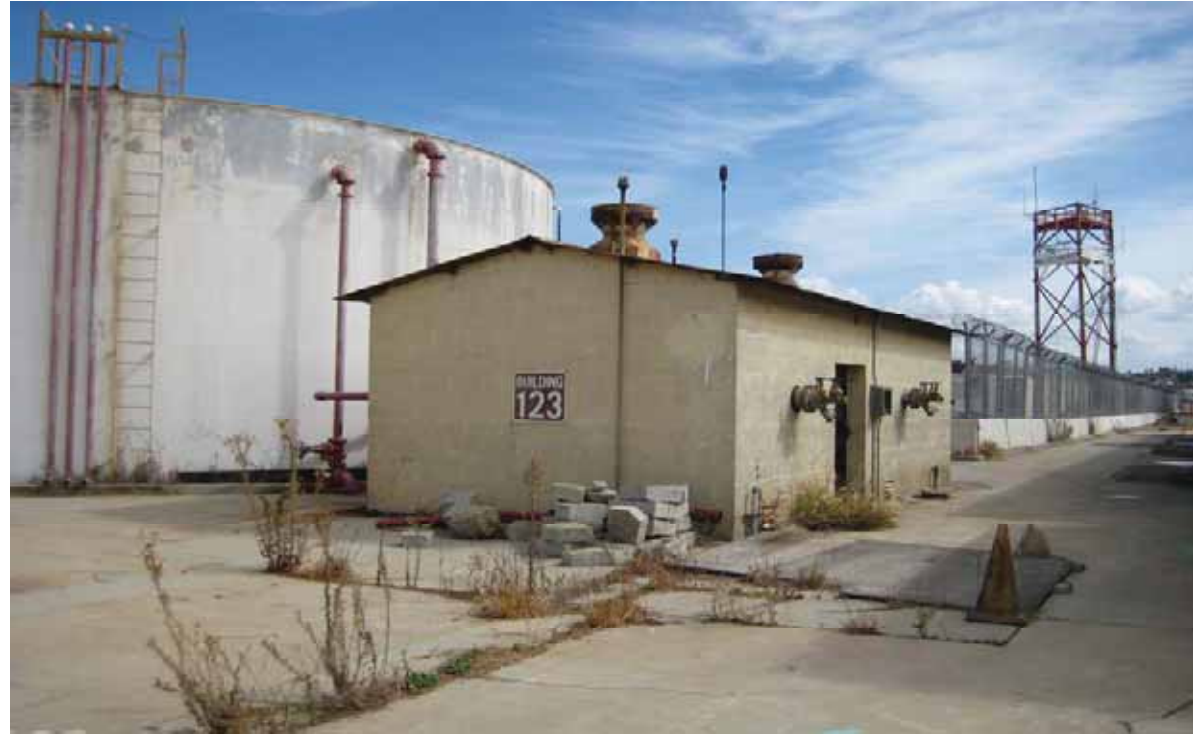
Building 123 - Pump Headquarters Associated with Standby Water Tank, Southwest Oblique, San Diego, California, October 2009.