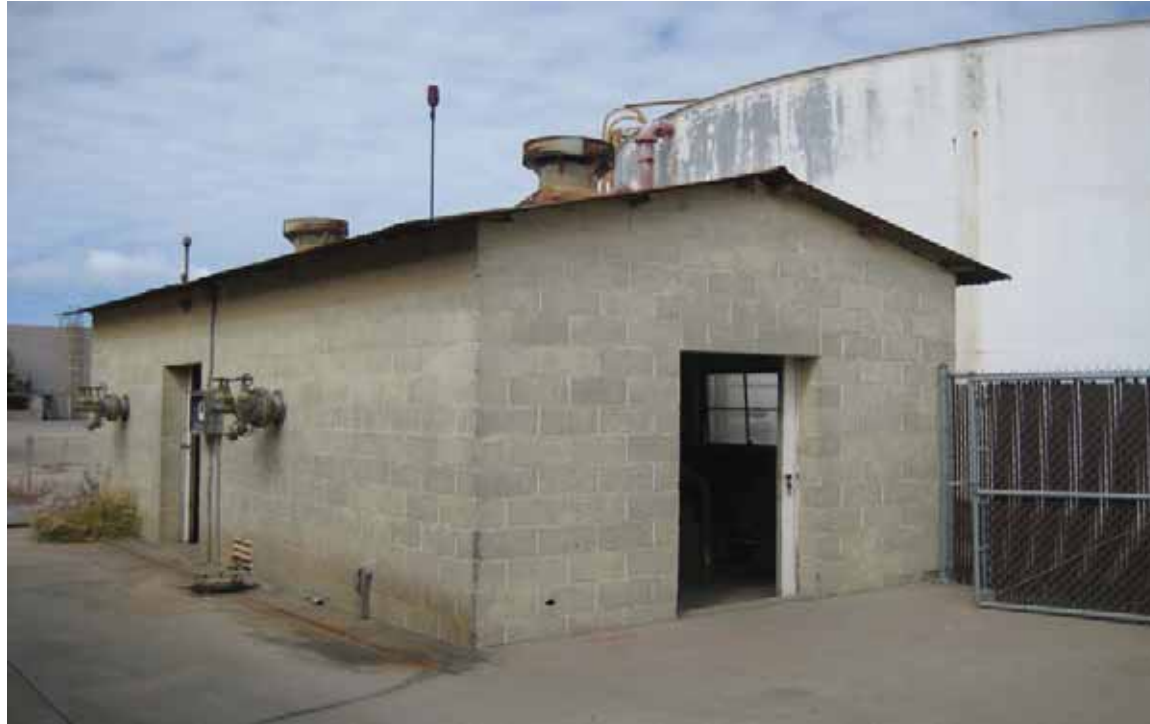
Building 123 - Pump Headquarters Associated with Standby Water Tank, Southeast Oblique, San Diego, California, October 2009.