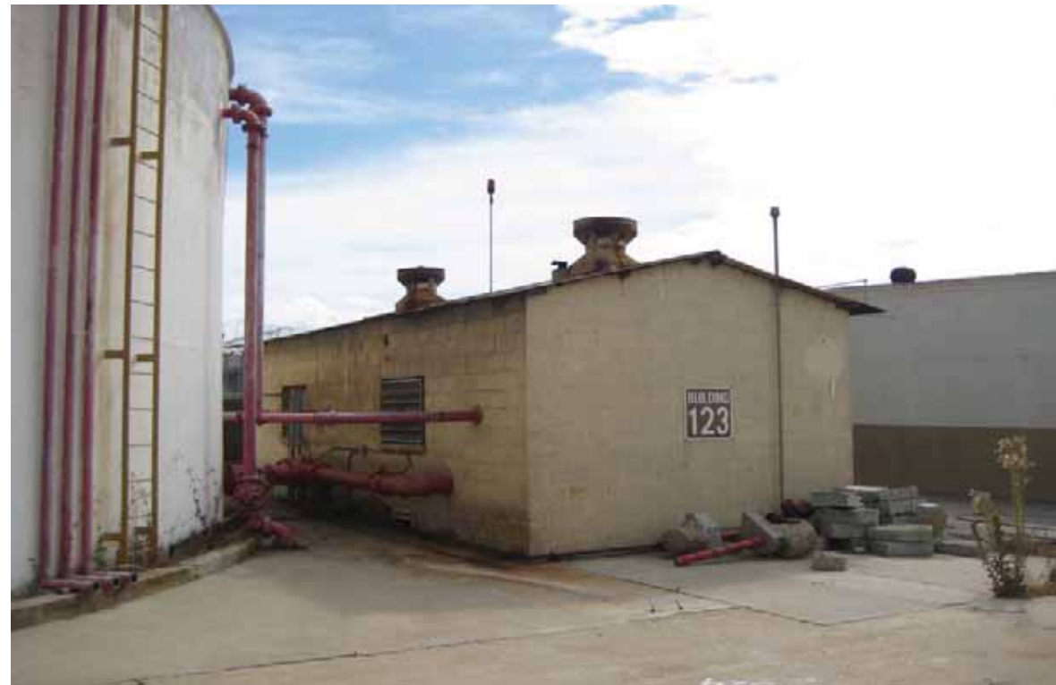
Building 123 - Pump Headquarters Associated with Standby Water Tank, Northwest Oblique, San Diego, California, October 2009.