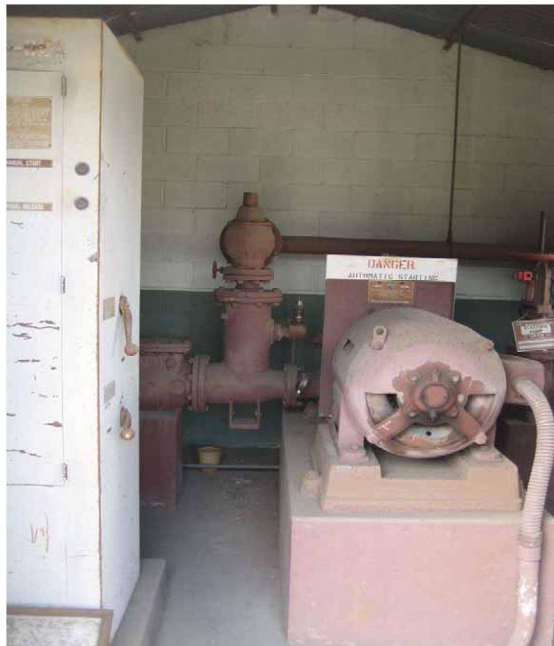
Building 123 - Pump Headquarters Associated with Standby Water Tank Interior, West Elevation, San Diego, California, October 2009.