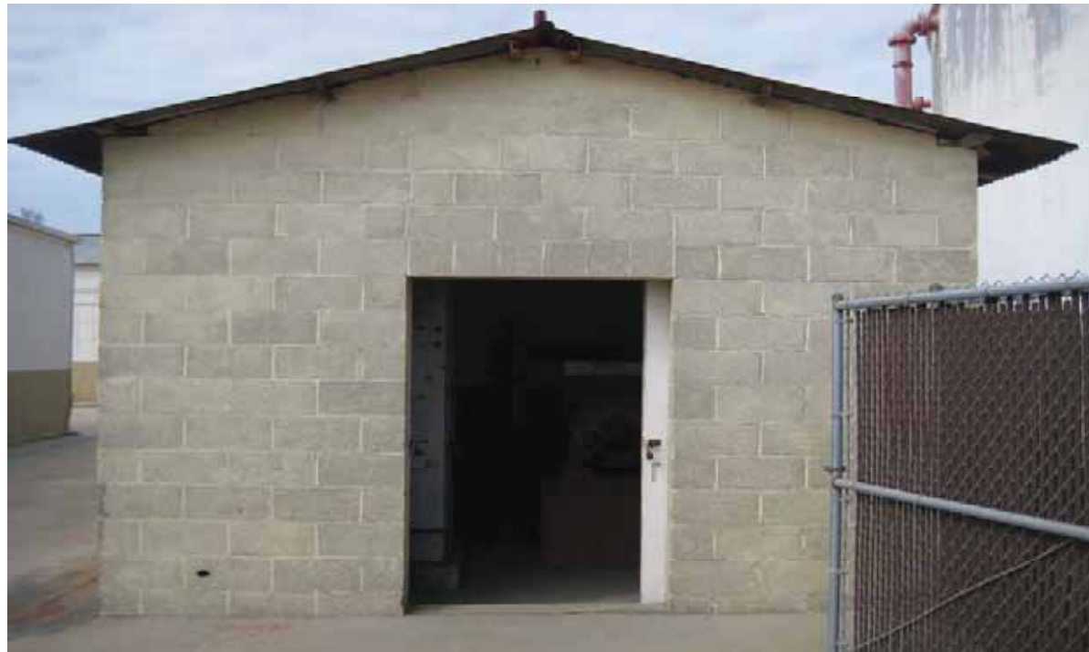
Building 123 - Pump Headquarters Associated with Standby Water Tank, East Elevation, San Diego, California, October 2009.