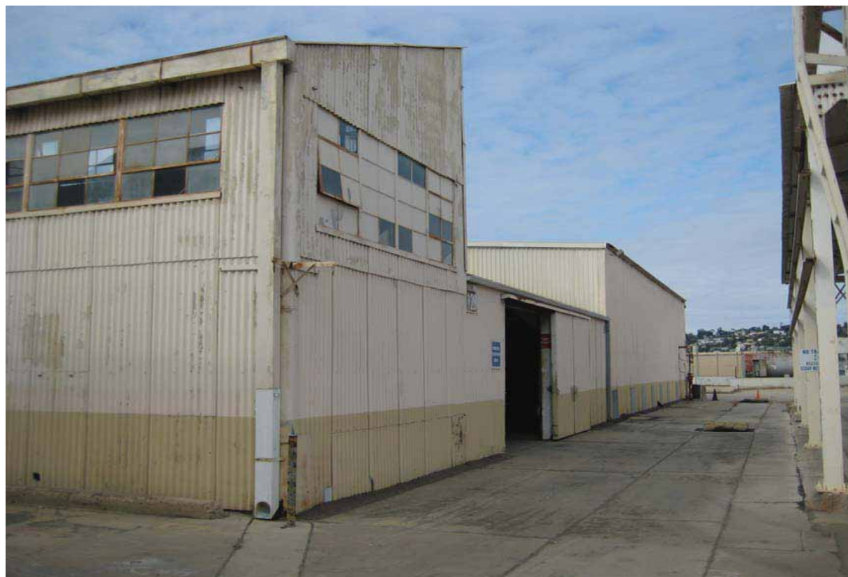
Building 128, Southeast Oblique, San Diego, California, October 2009.