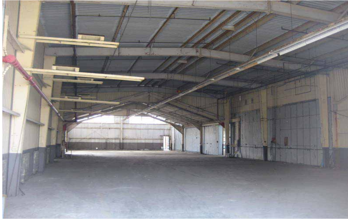
Building 128, Interior Southeast Elevation, San Diego, California, October 2009.