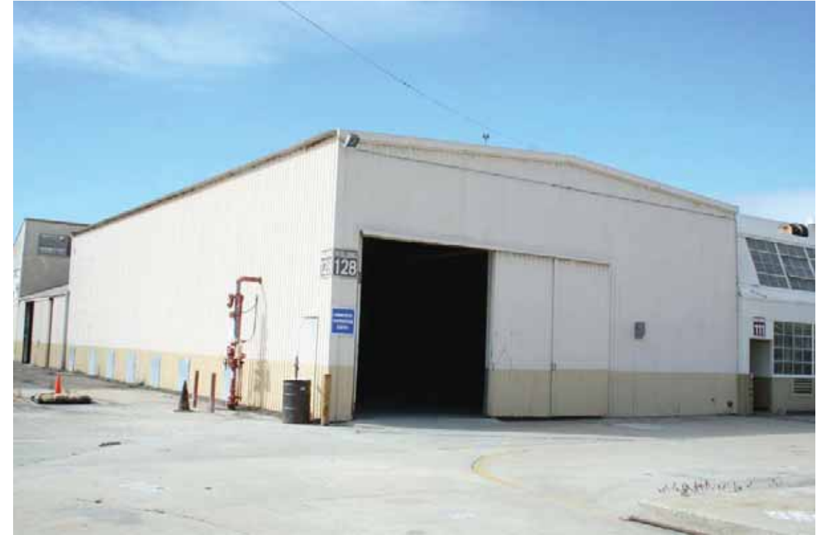
Building 128, Northeast Oblique, San Diego, California, October 2009.