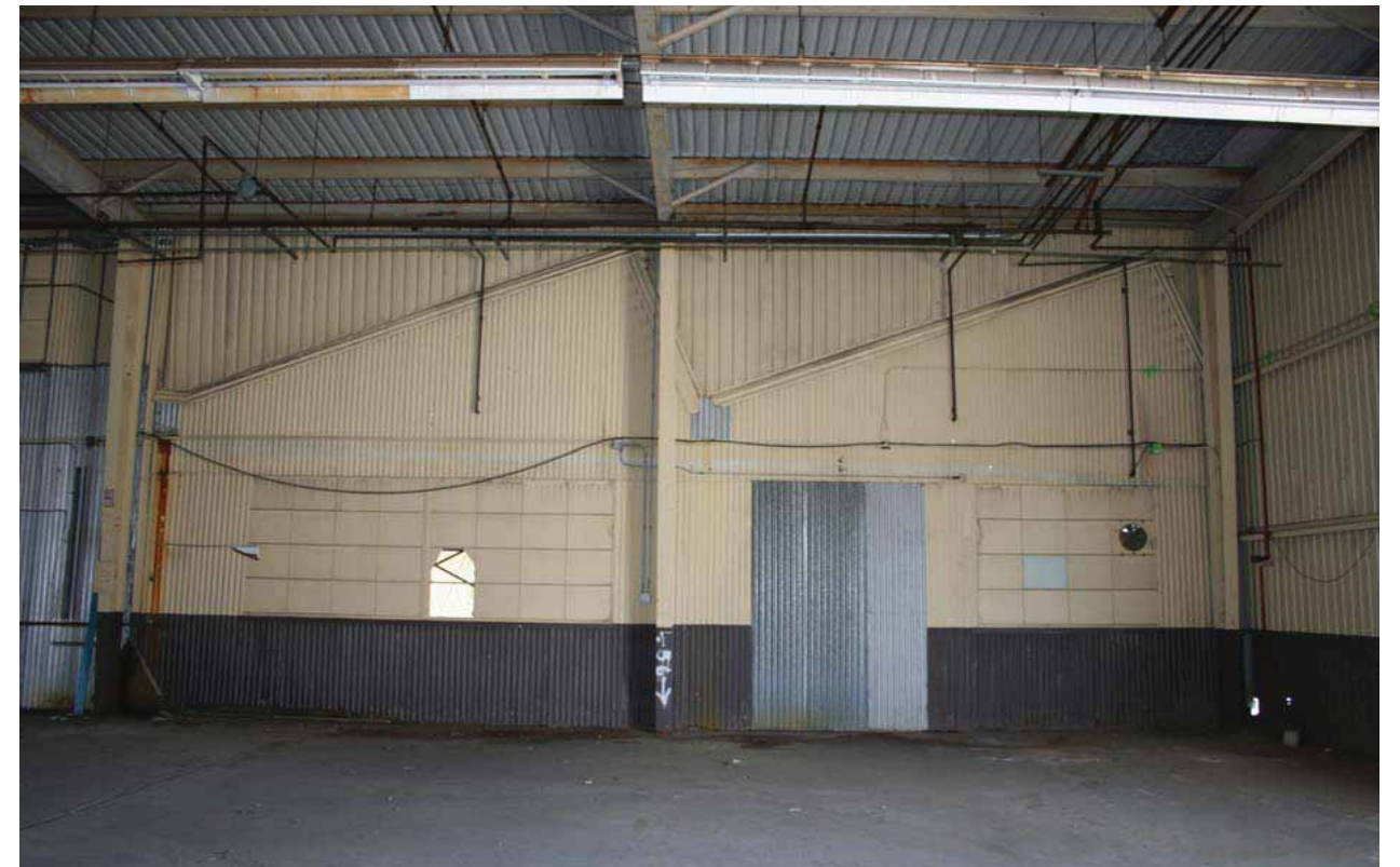
Building 128, Interior Northwest Elevation, San Diego, California, October 2009.