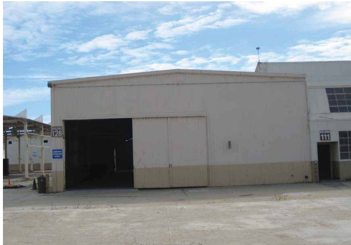
Building 128, North Elevation, San Diego, California, October 2009.