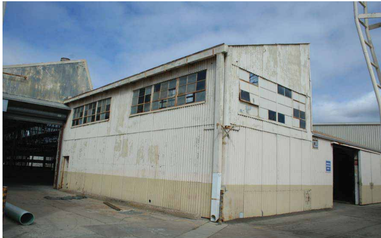
Building 128, Southeast Elevation, San Diego, California, October 2009.