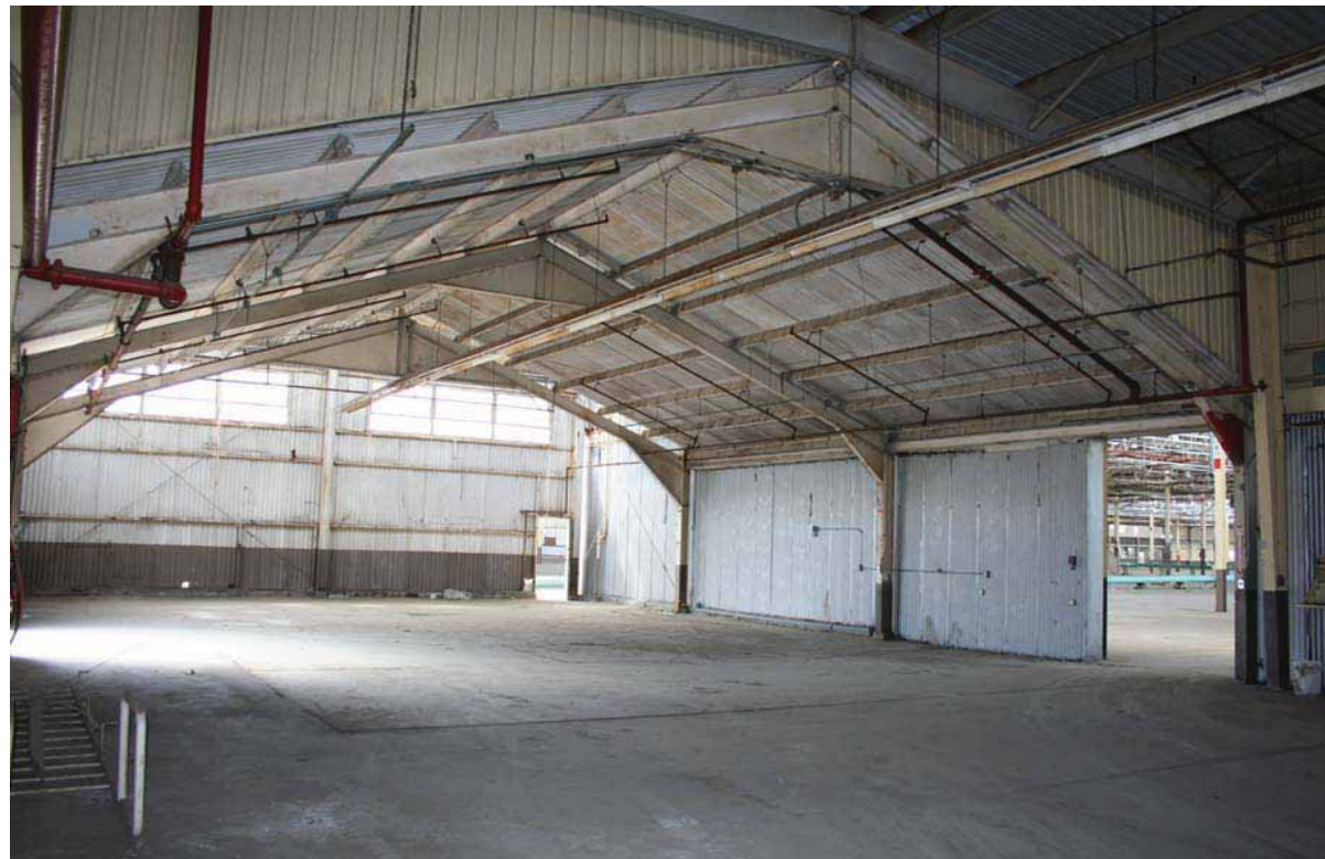
Building 128, Interior Southeast Elevation, San Diego, California, October 2009.