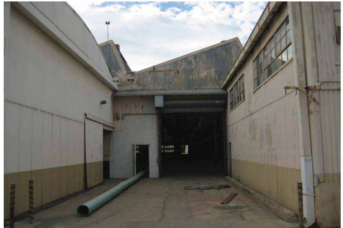
Building 128, East Elevation, San Diego, California, October 2009.