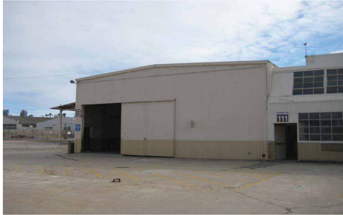
Building 128, Northwest Oblique, San Diego, California, October 2009.