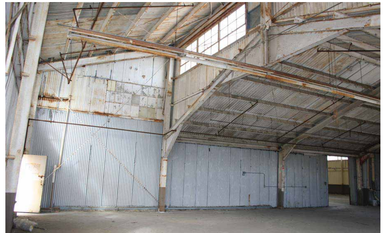
Building 128, Interior Northwest Elevation, San Diego, California, October 2009.