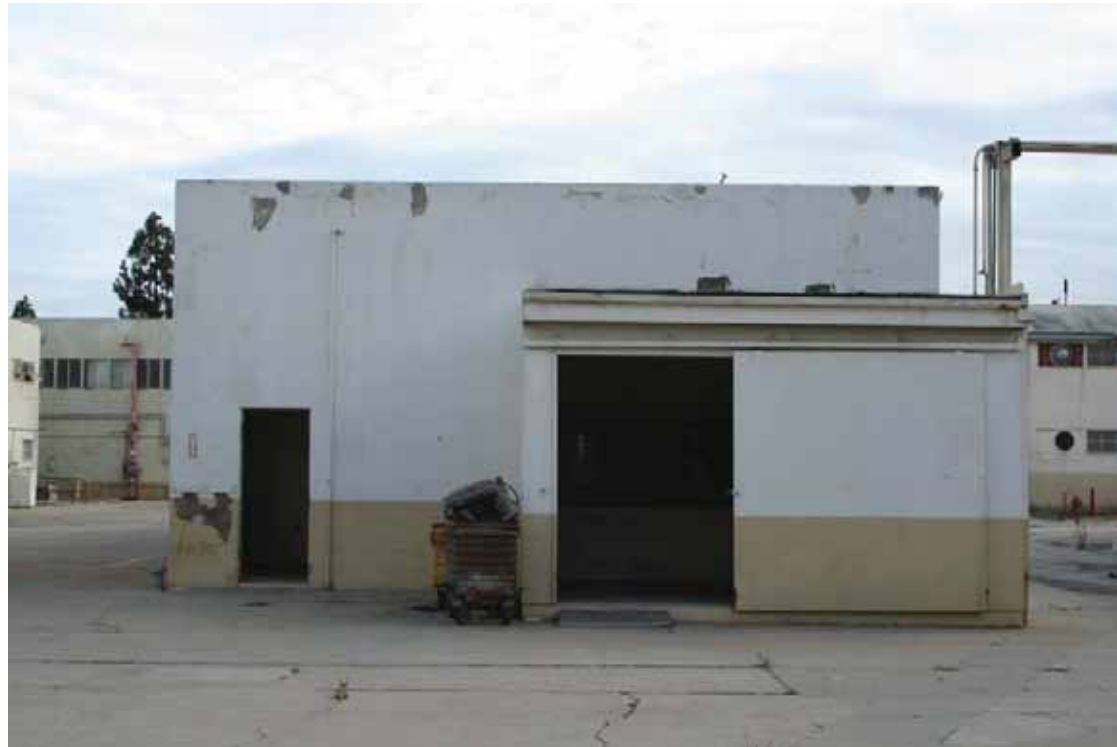
Building 142 - Repair Building, North Elevation, San Diego County Regional Airport, California, October 2009.