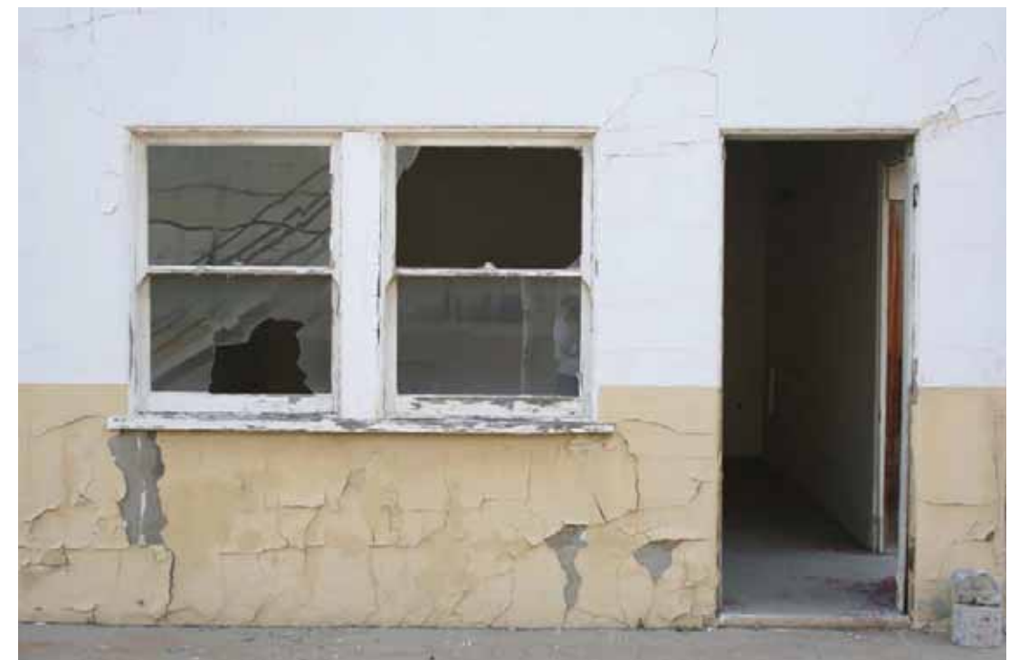
Building 142 - Repair Building, East Elevation, detail, San Diego County Regional Airport, California, October 2009.