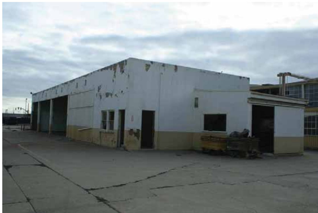
Building 142 - Repair Building, Northeast Oblique, San Diego County Regional Airport, California, October 2009.