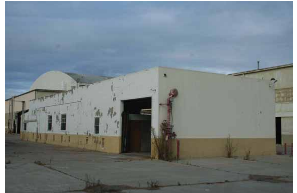
Building 142 - Repair Building, Southwest Oblique, San Diego County Regional Airport, California, October 2009.