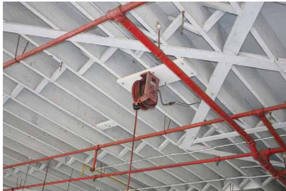
Building 142 - Repair Building Interior, facing ceiling, San Diego County Regional Airport, California, October 2009.