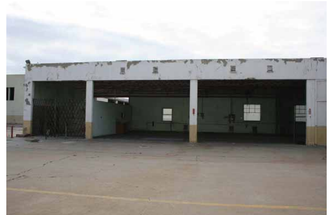
Building 142 - Repair Building, East Elevation, San Diego County Regional Airport, California, October 2009.