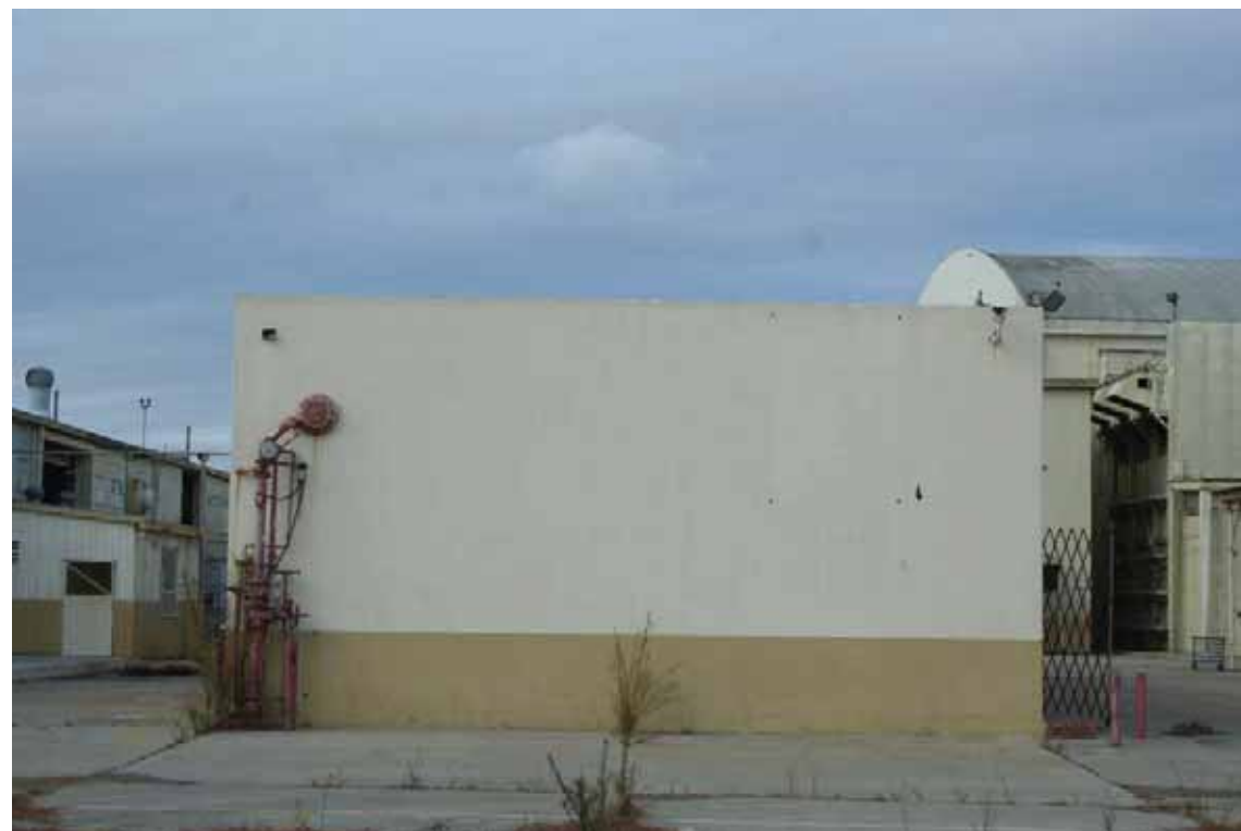
Building 142 - Repair Building, south elevation, San Diego County Regional Airport, California, October 2009.