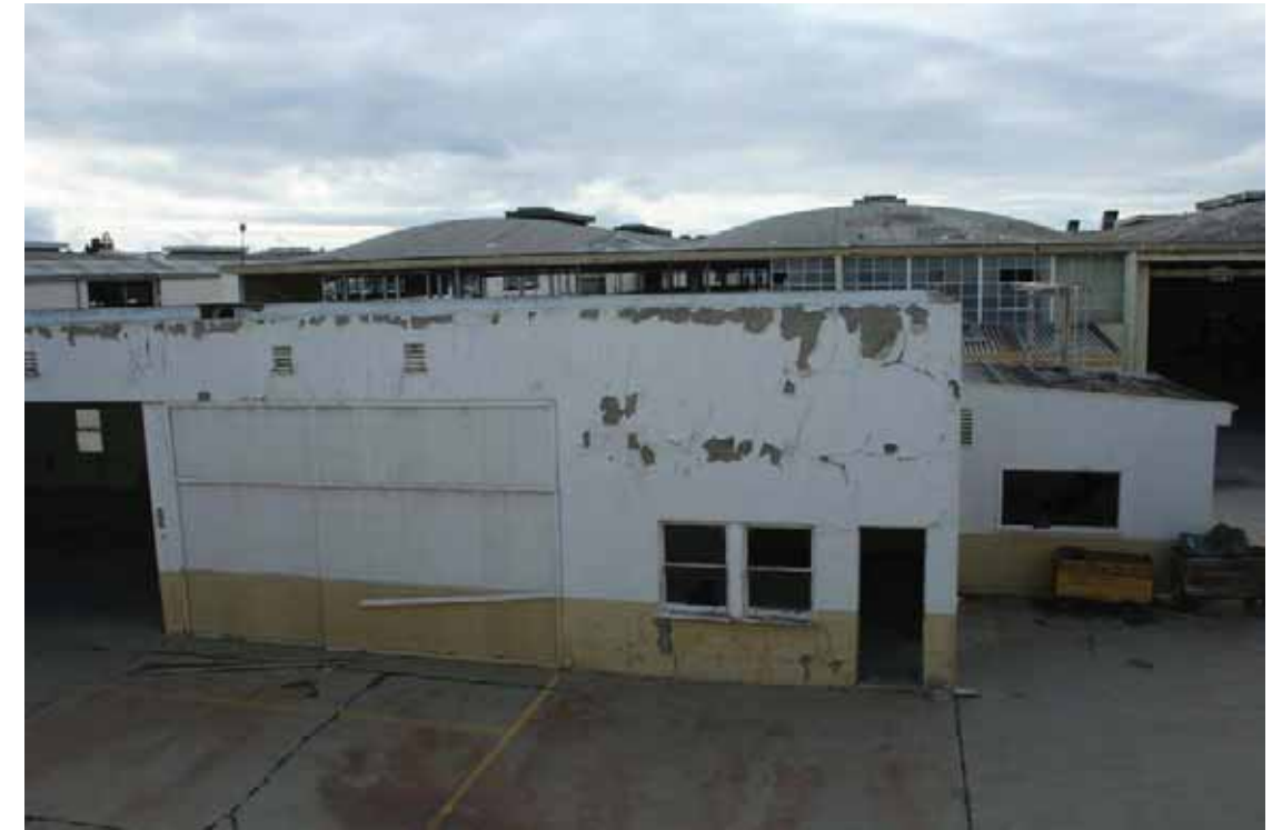
Building 142 - Repair Building, East Elevation, San Diego County Regional Airport, California, October 2009.