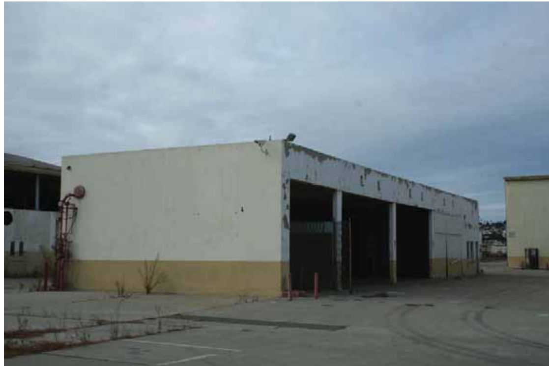
Building 142 - Repair Building, Southeast Oblique, San Diego County Regional Airport, California, October 2009.