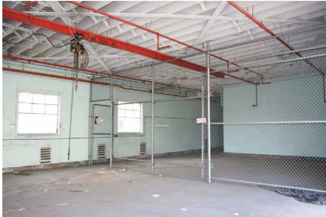
Building 142 - Repair Building Interior, facing Northwest, San Diego County Regional Airport, California, October 2009.