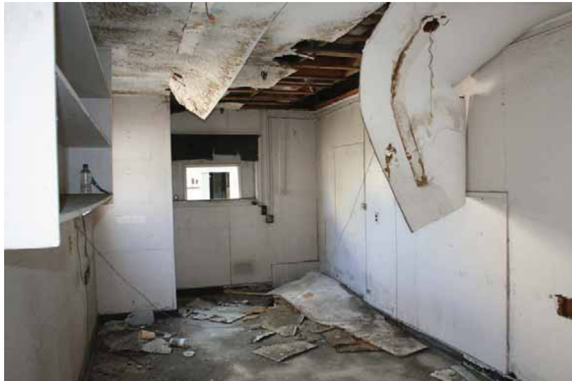
Building 154 - Ancillary Building Interior, facing East, San Diego County Regional Airport, California, October 2009.