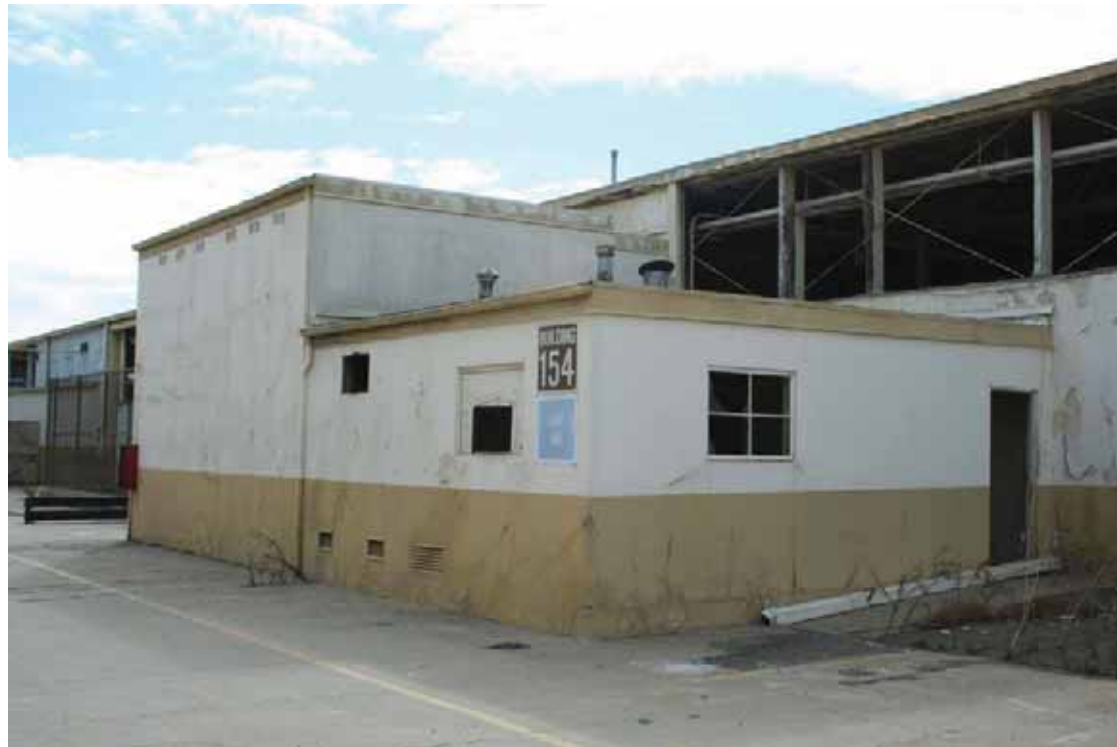
Building 154 - Ancillary Building, Northeast Oblique, San Diego County Regional Airport, California, October 2009.