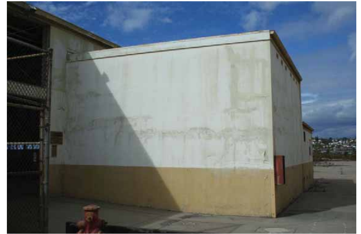
Building 154 - Ancillary Building, South Elevation, San Diego County Regional Airport, California, October 2009.