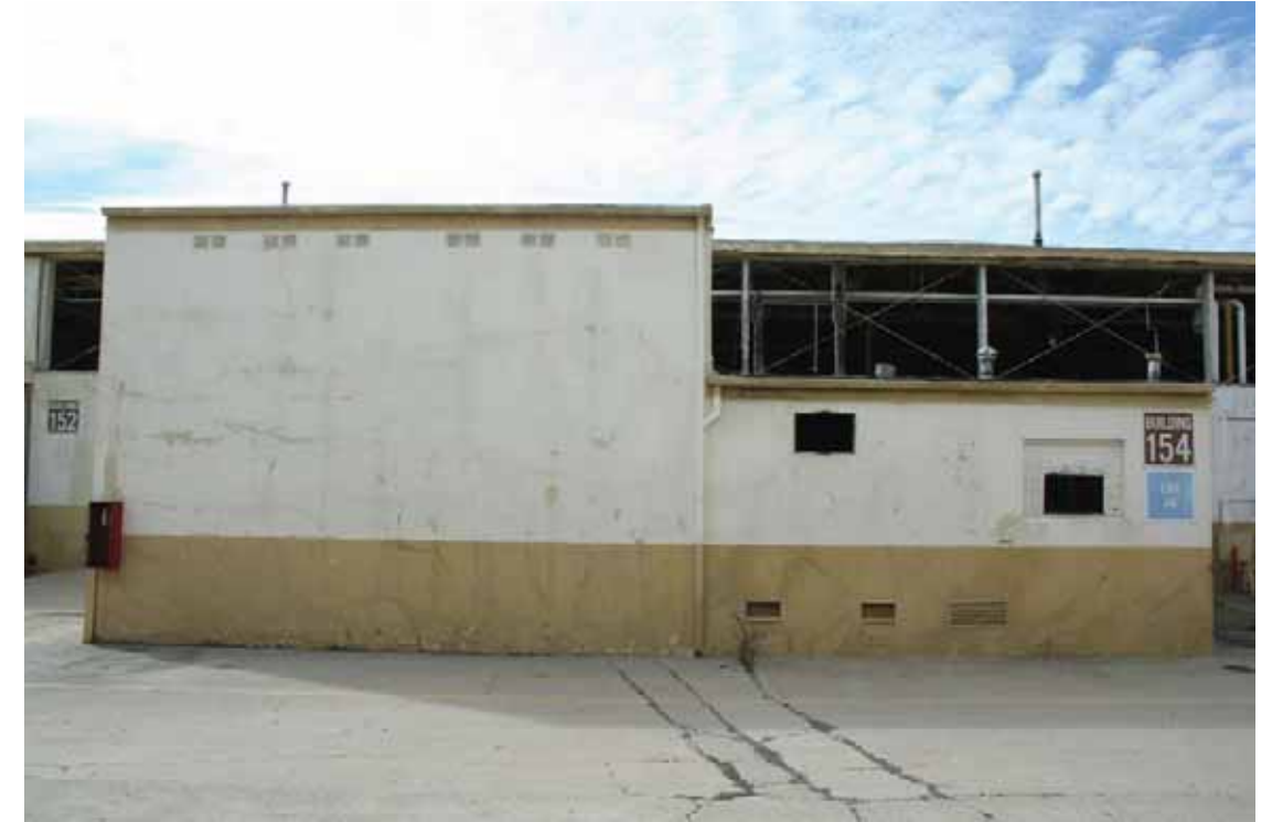
Building 154 - Ancillary Building, East Elevation, San Diego County Regional Airport, California, October 2009.