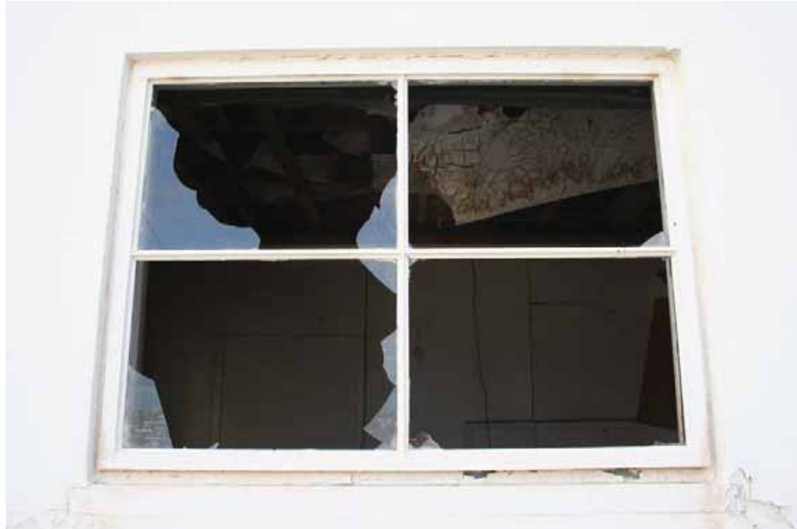
Building 154 - Ancillary Building, Detail on North Elevation Metal Window, San Diego County Regional Airport, California, October 2009.