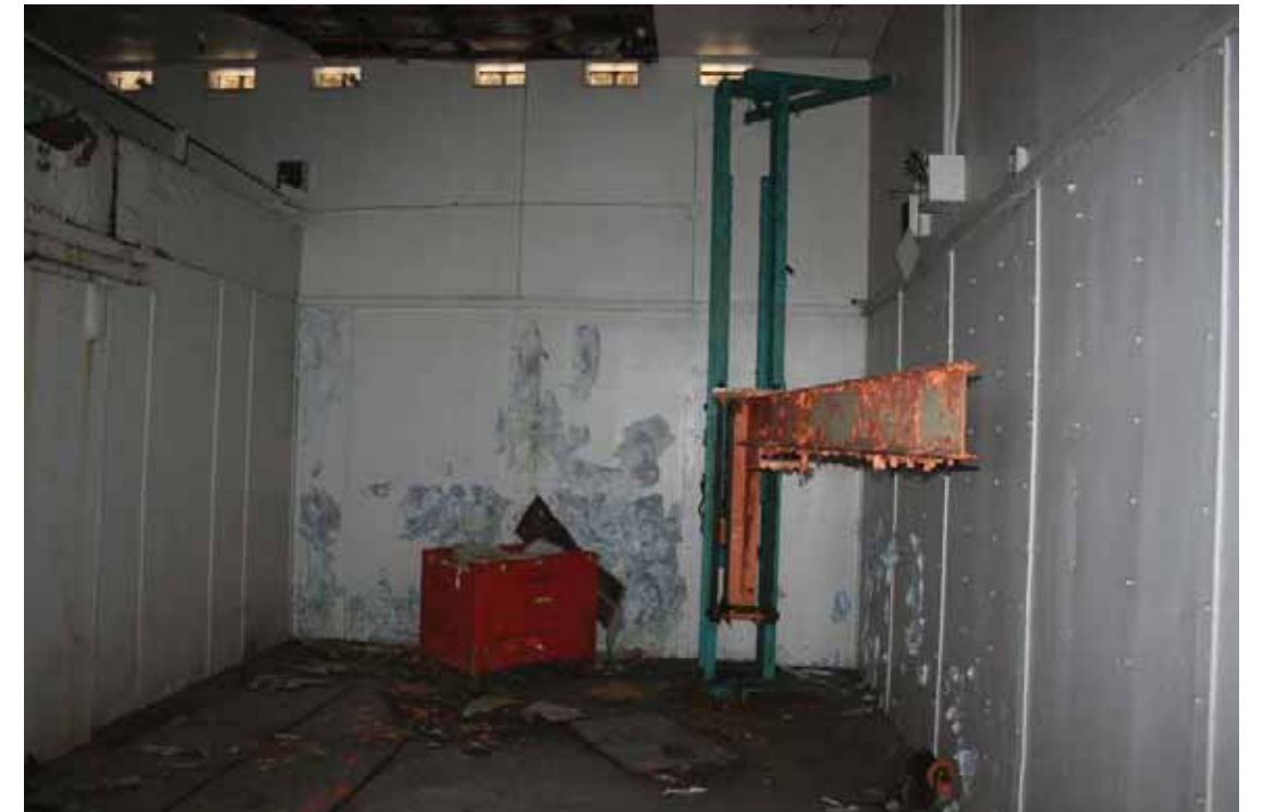
Building 154 - Ancillary Building Interior, X-Ray Room, facing East, San Diego County Regional Airport, California, October 2009.