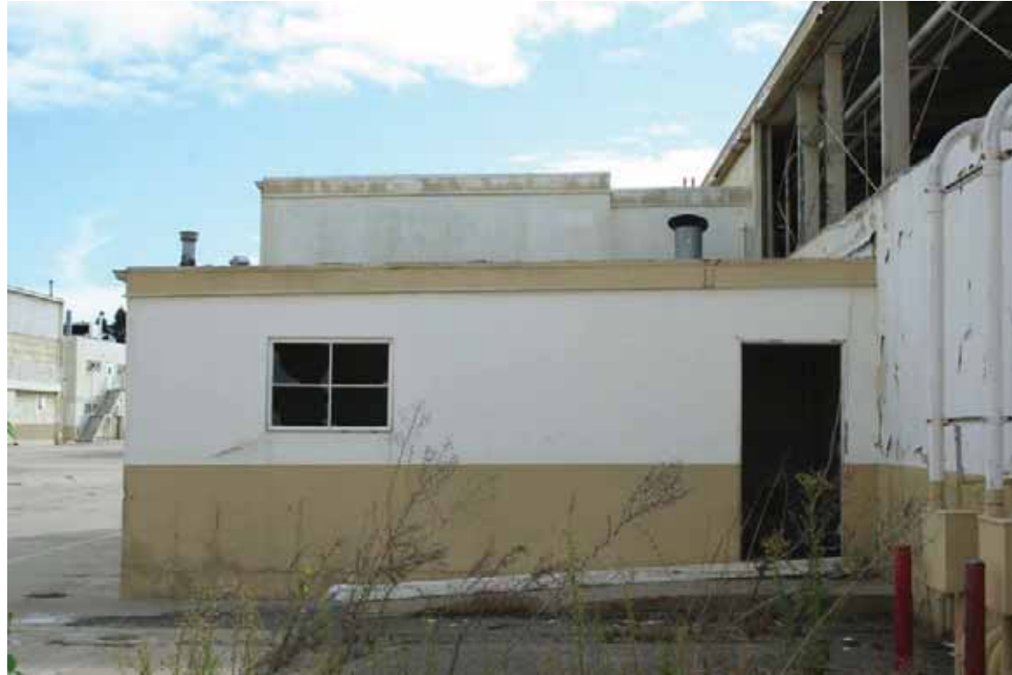
Building 154 - Ancillary Building, North Elevation, San Diego County Regional Airport, California, October 2009.