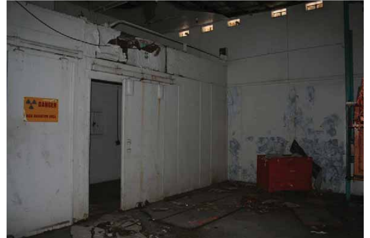
Building 154 - Ancillary Building Interior, X-Ray Room, facing Northeast, San Diego County Regional Airport, California, October 2009.