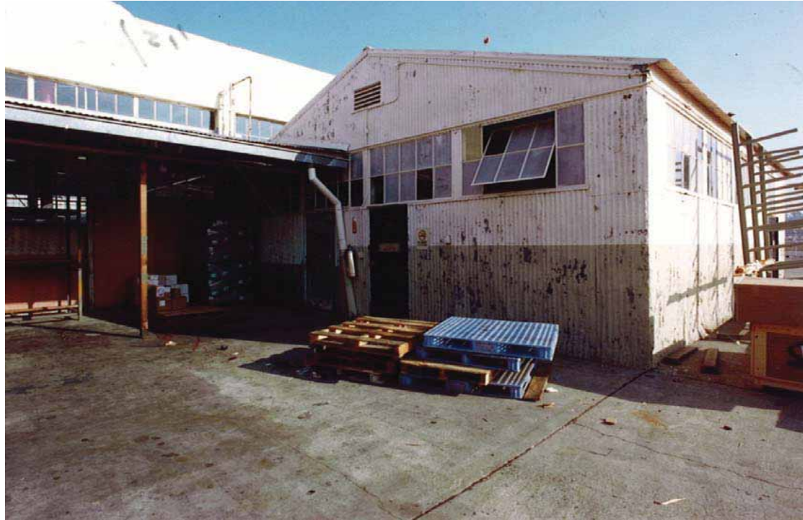
Building 182 - Old Record Storage Building, San Diego, California, Date unknown.