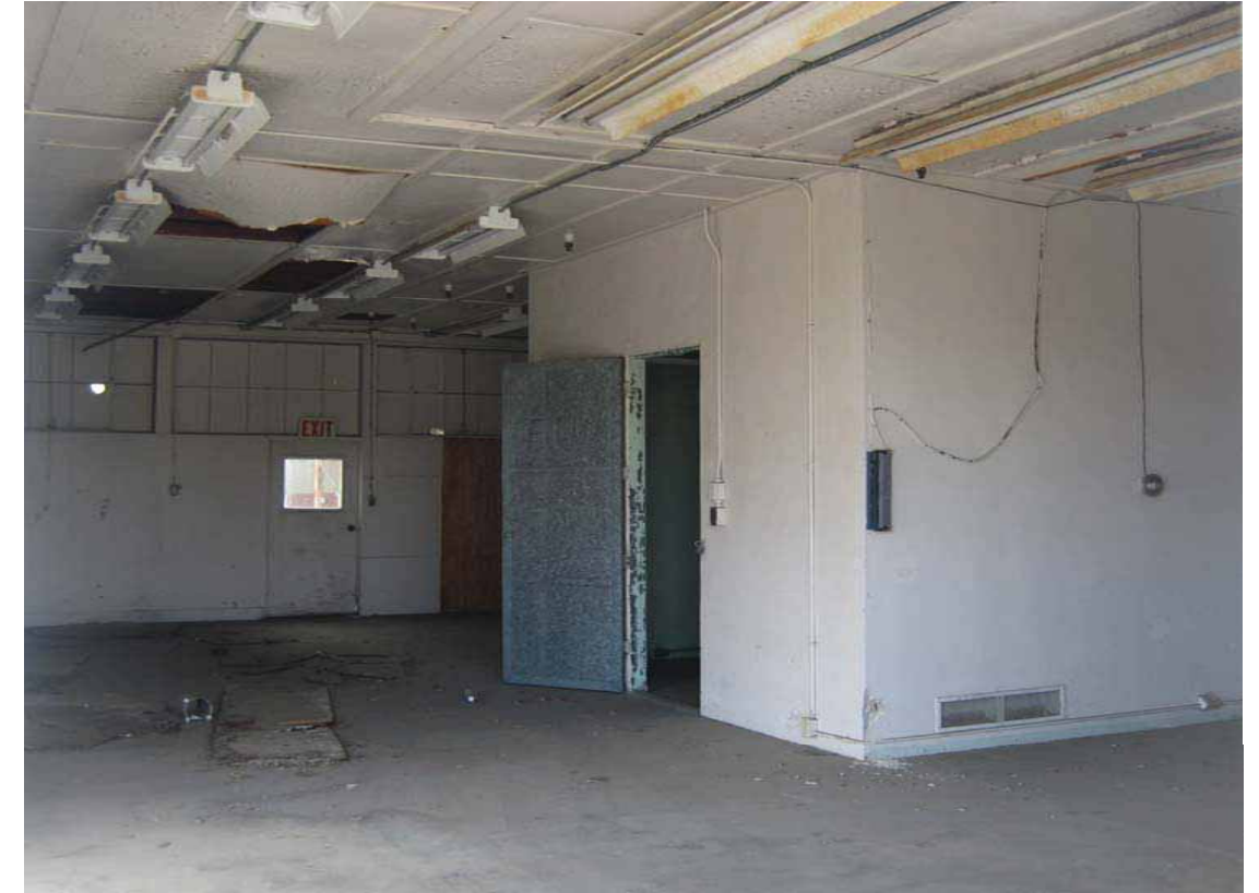
Building 182 - Old Record Storage Building Interior, facing Southwest, San Diego, California, October 2009.