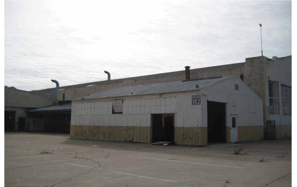
Building 182 - Old Record Storage Building, Northeast Oblique, San Diego, California, October 2009.