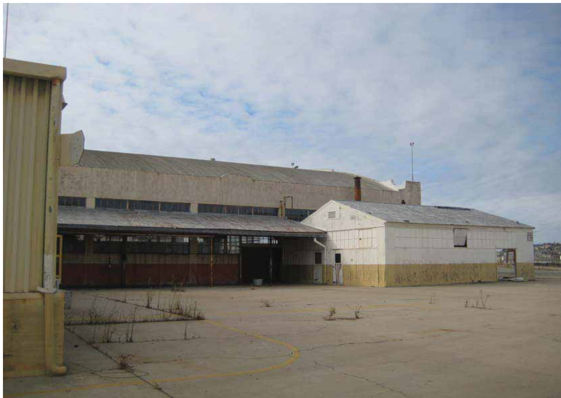
Building 182 - Old Record Storage Building, Southeast Oblique, San Diego, California, October 2009.