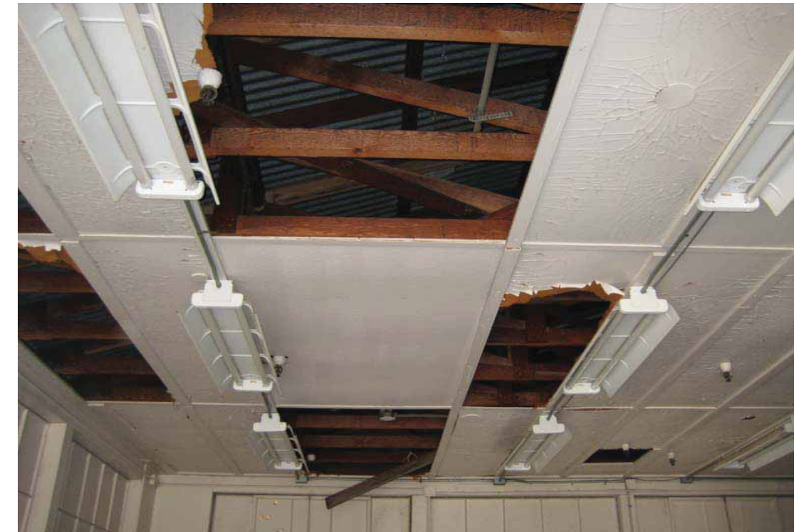
Building 182 - Old Record Storage Building Interior, detail of ceiling, San Diego, California, October 2009.