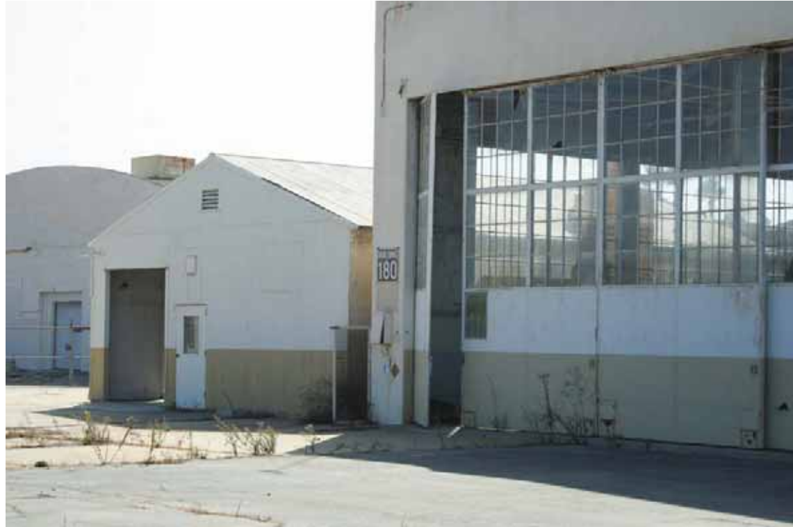
Building 182 - Old Record Storage Building, Northwest Oblique, San Diego, California, October 2009.