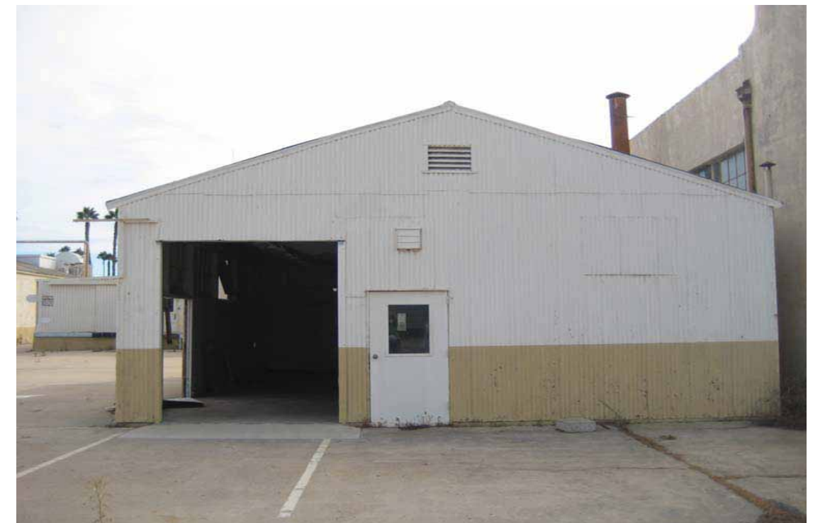
Building 182 - Old Record Storage Building, North Elevation, San Diego, California, October 2009.