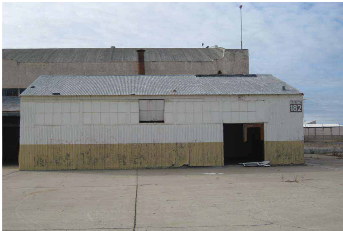
Building 182 - Old Record Storage Building, East Elevation, San Diego, California, October 2009.