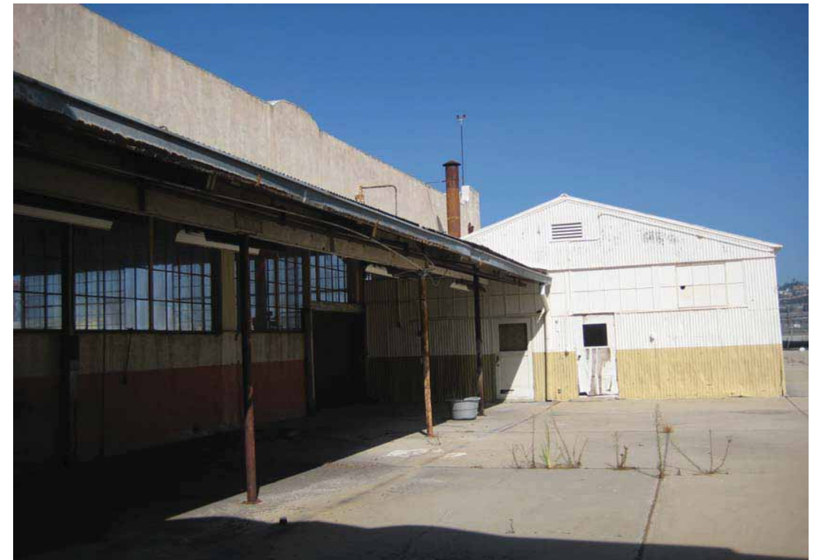
Building 221 - Covered Walkway, North Elevation, San Diego, California, October 2009.