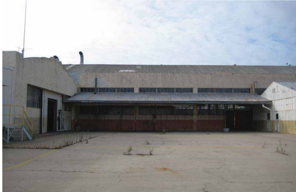
Building 221 - Covered Walkway, East Elevation, San Diego, California, October 2009.