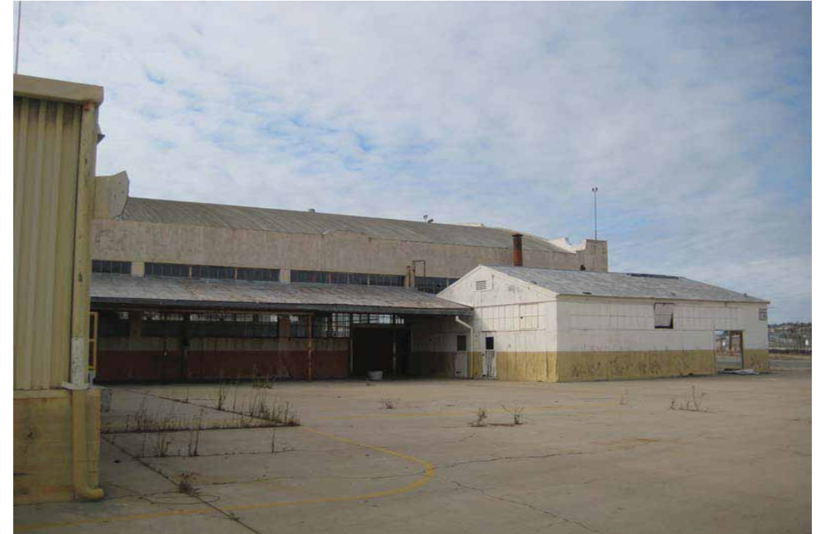
Building 221 - Covered Walkway, Northeast Elevation, San Diego, California, October 2009.