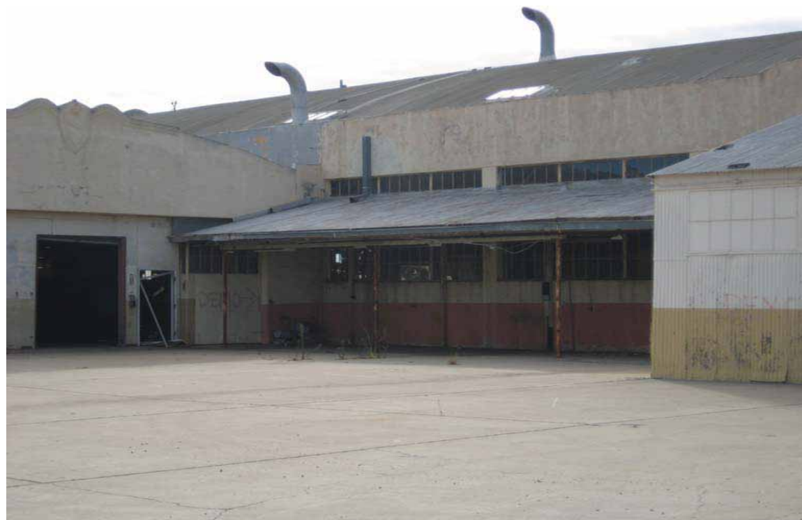
Building 221 - Covered Walkway, Southeast Oblique, San Diego, California, October 2009.