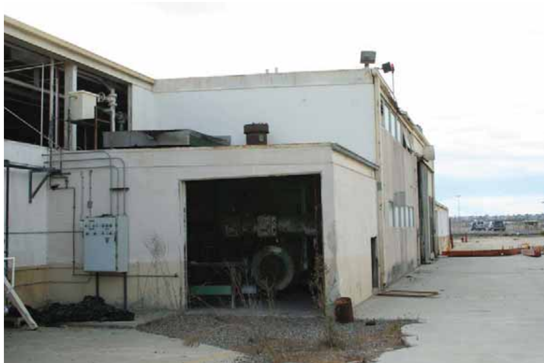
Building 230 - East Elevation, San Diego, California, October 2009.