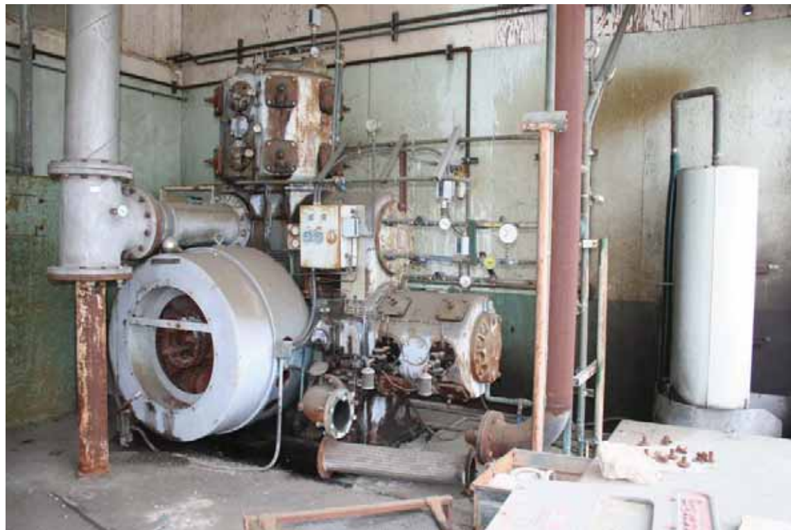
Building 230 - Interior, Center Section, San Diego, California, October 2009.