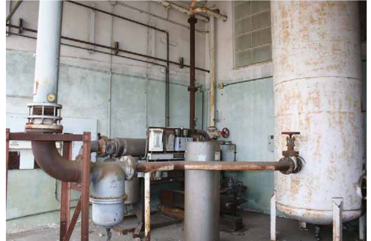
Building 230 - Interior, East Wall facing East, San Diego, California, October 2009.