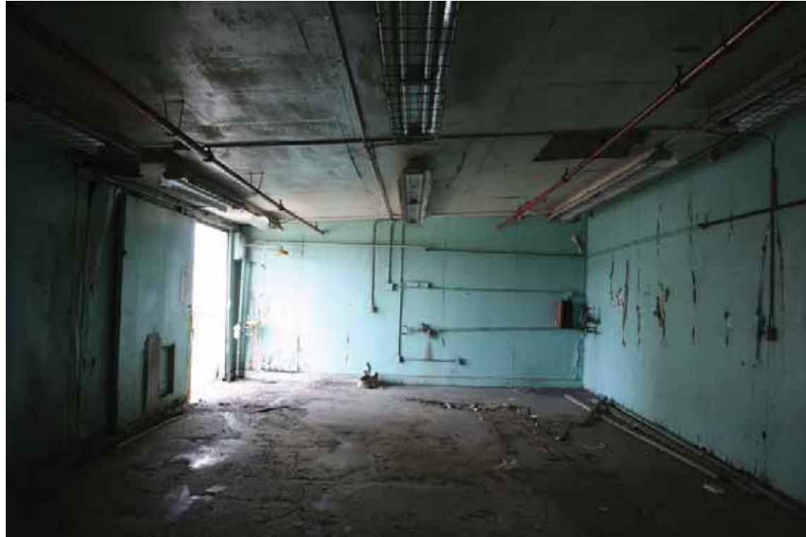
Building 230 - Interior, West Section facing East, San Diego, California, October 2009.