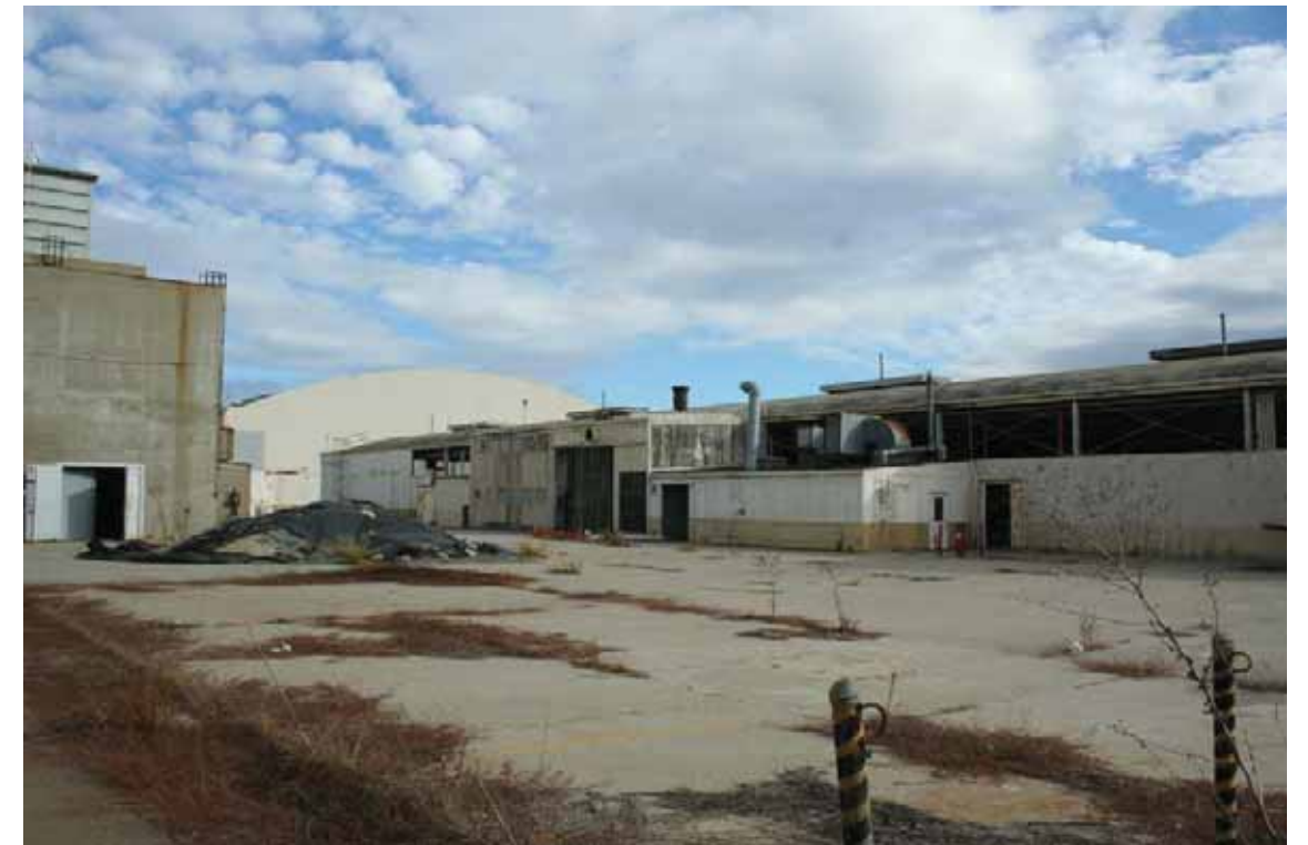
Building 230 - Context, facing Southwest, San Diego, California, October 2009.