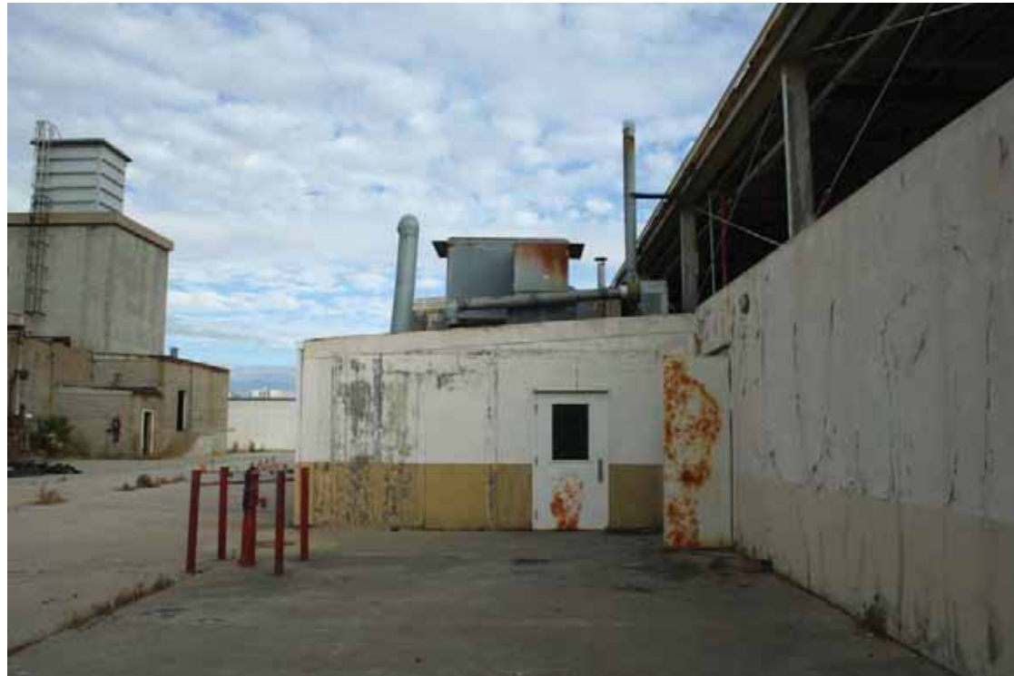
Building 230 - West Elevation, San Diego, California, October 2009.