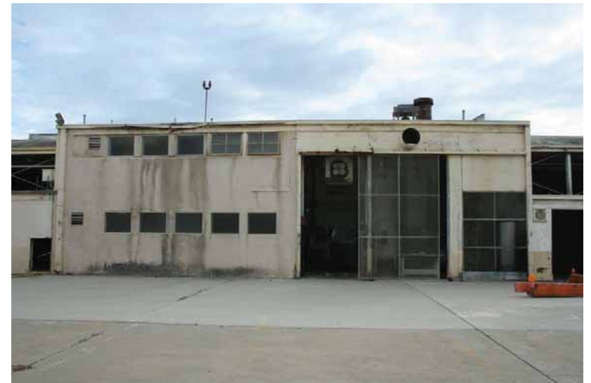
Building 230 - center Section of North Elevation, San Diego, California, October 2009.