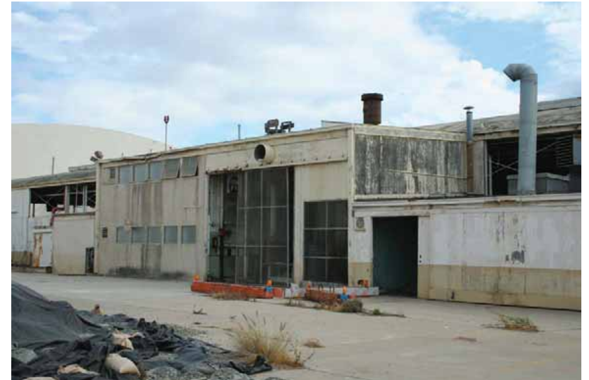
Building 230 - North Elevation, San Diego, California, October 2009.