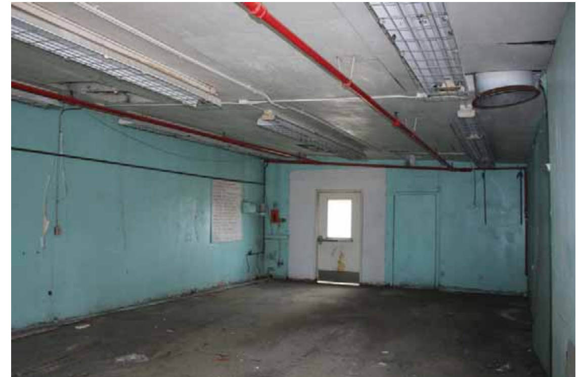
Building 230 - Interior, West Section facing West, San Diego, California, October 2009.