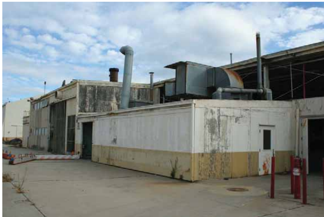
Building 230 - Northwest Oblique, San Diego, California, October 2009.