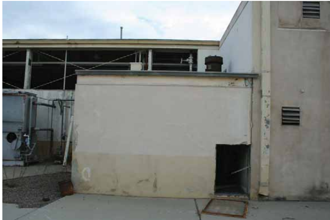
Building 230 - East Section of North Elevation, San Diego, California, October 2009.