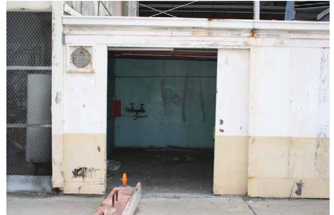
Building 230 - door detail, North Elevation, San Diego, California, October 2009.