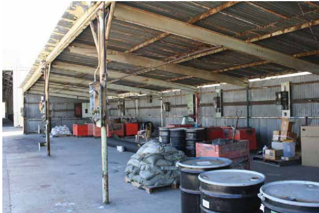
Building 242 - Storage Shed Interior, facing Southeast, San Diego, California, October 2009.