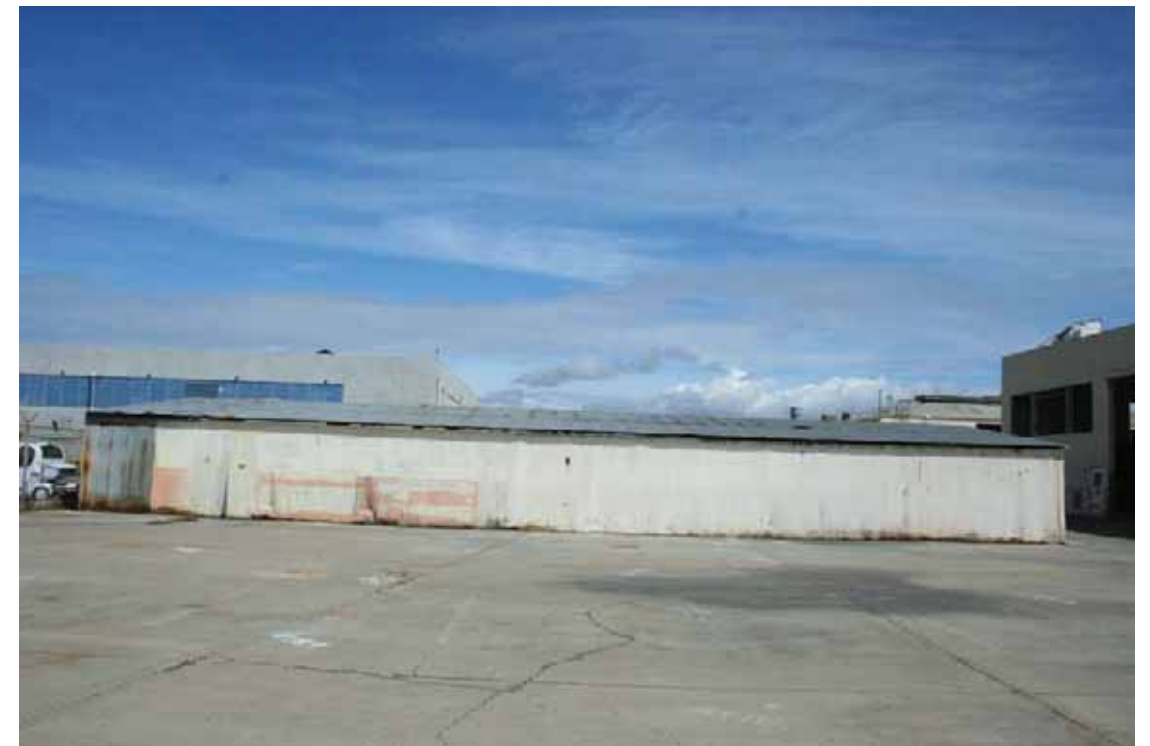
Building 242 - Storage Shed, South Elevation, San Diego, California, October 2009.