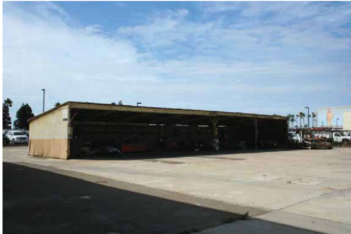
Building 242 - Storage Shed, Northeast Oblique, San Diego, California, October 2009.