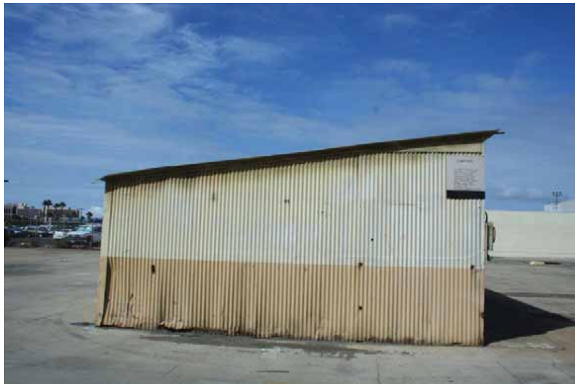
Building 242 - Storage Shed, East Elevation, San Diego, California, October 2009.