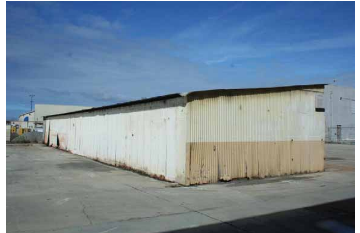
Building 242 - Storage Shed, Southeast Oblique, San Diego, California, October 2009.