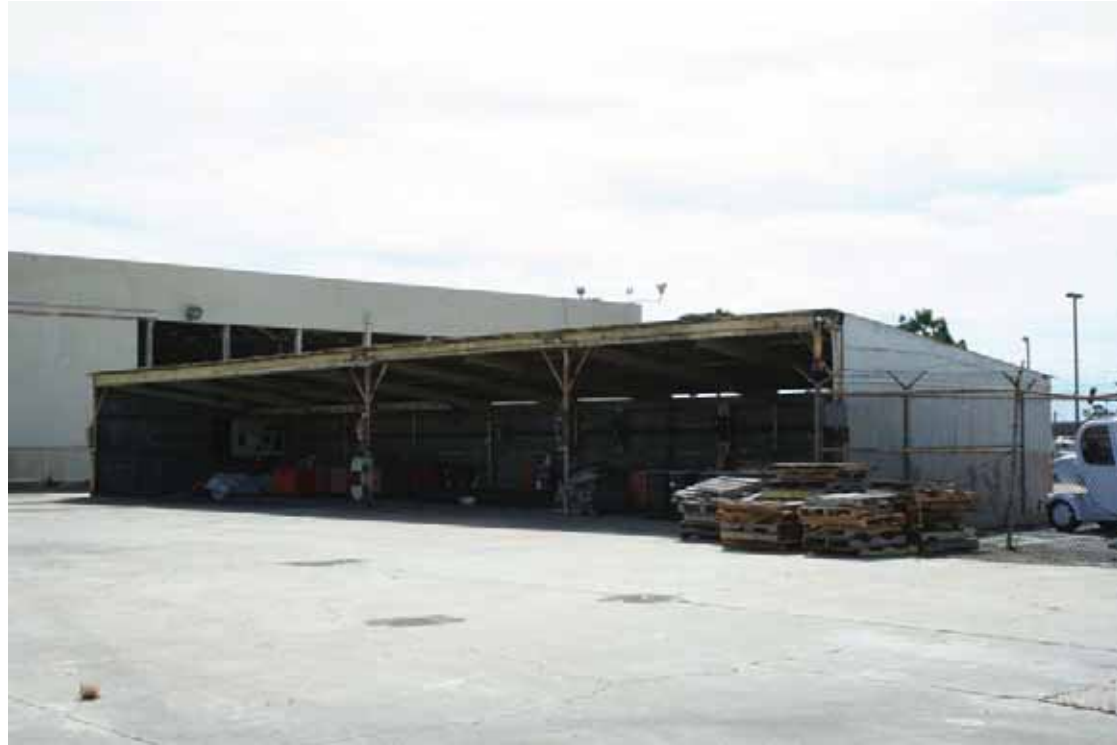
Building 242 - Storage Shed, Northwest Oblique, San Diego, California, October 2009.