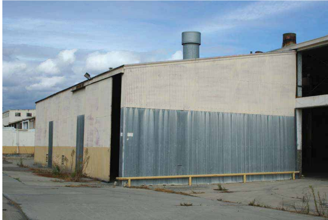
Building 513 - Ancillary Building Associated With Building 156, West Oblique, San Diego, California, October 2009.