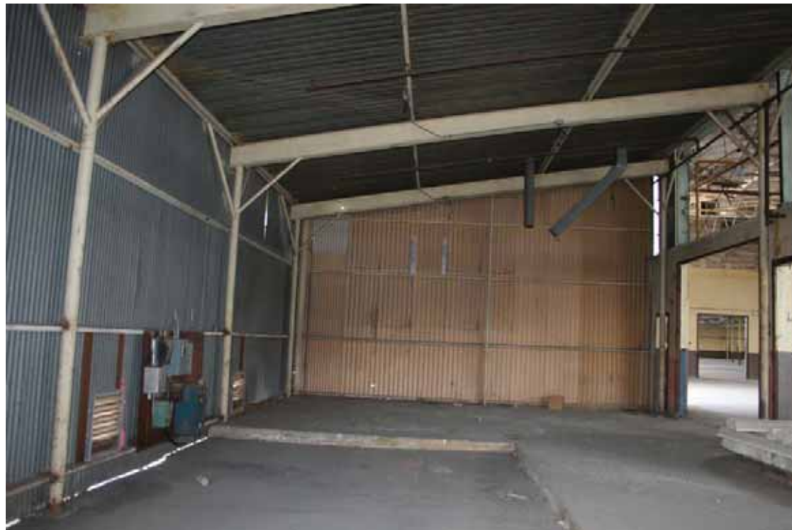
Building 513 - Ancillary Building Associated With Building 156, Interior, facing North with an entry to Building 156 to the right, San Diego, California, October 2009.