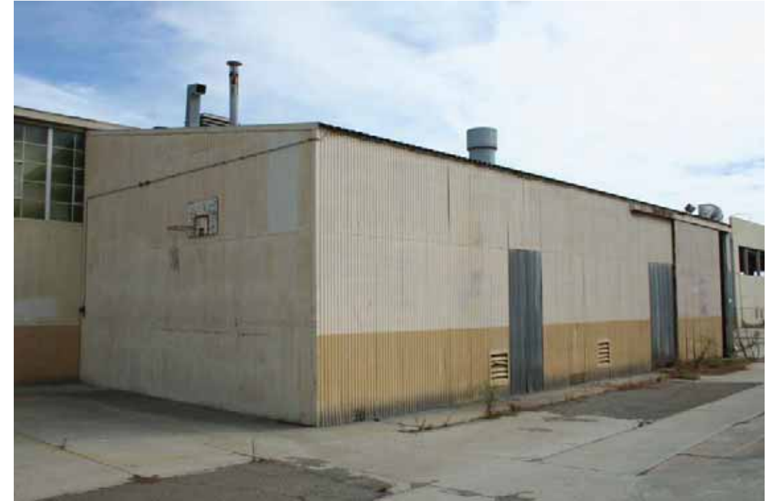
Building 513 - Ancillary Building Associated With Building 156, Northwest Oblique, San Diego, California, October 2009.