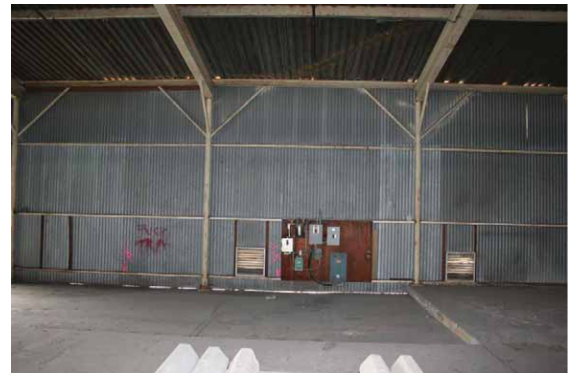
Building 513 - Ancillary Building Associated With Building 156, Interior facing West, San Diego, California, October 2009.