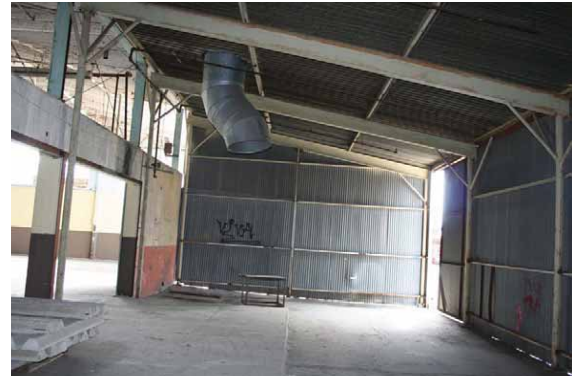
Building 513 - Ancillary Building Associated With Building 156, Interior, facing South with Building 156 to the left, San Diego, California, October 2009.