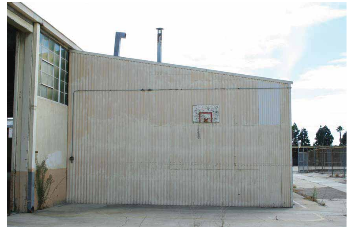
Building 513 - Ancillary Building Associated With Building 156, North Elevation, San Diego, California, October 2009.