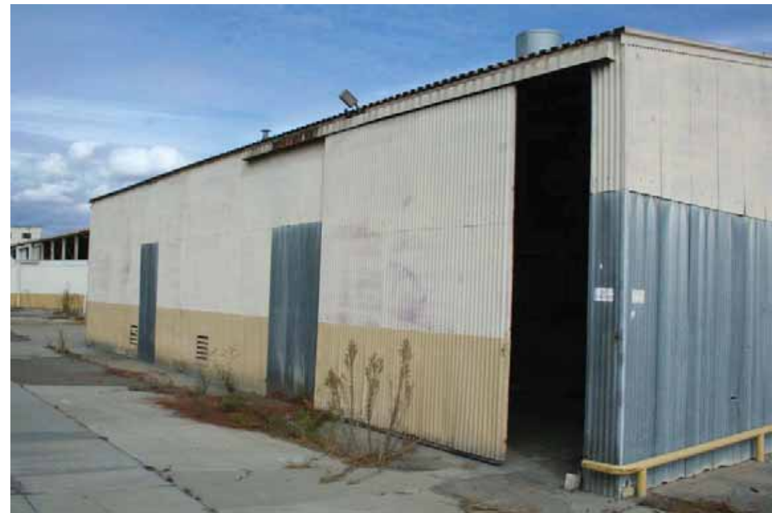
Building 513 - Ancillary Building Associated With Building 156, West Elevation, San Diego, California, October 2009.