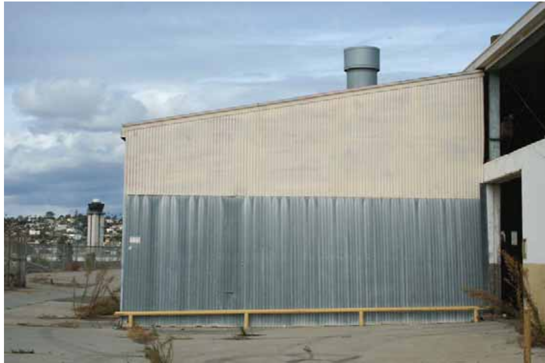
Building 513 - Ancillary Building Associated With Building 156, South Elevation, San Diego, California, October 2009.